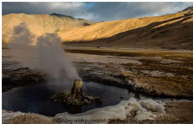
Bubbling with potential: The Puga hot springs area in Ladakh has been identified as holding the greatest geothermal energy potential of any site in India, at over 5 GWh

BIG STORY ( HTTPS://CARBONCOPY.INFO/CATEGORY/BIG-STORY/ )